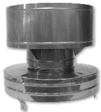
STAINLESS STEEL VERTICAL ROUND CO-LINEAR CAP w/ROUND BASE

Caps are made with 304 stainless steel for a more corrosion resistant cap.